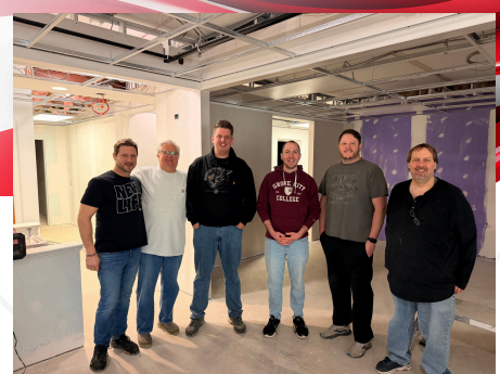
Vibrant and LCBC at Spring Garden.