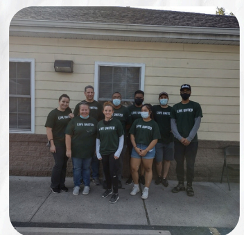
We love work teams